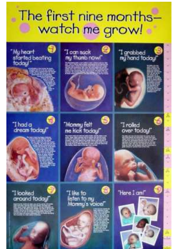
Large all-in-one 24'' x 36'' poster